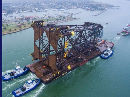
Vessel Agency & Clearance for Oil Rig Jacket