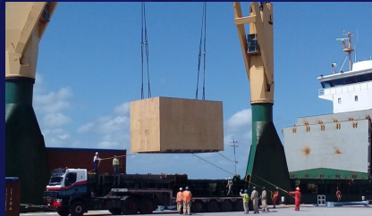
Discharge & Customs Clearance of Generator