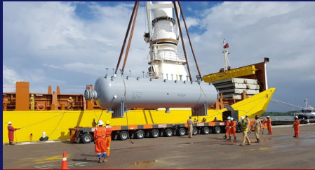
Discharge & Customs Clearance of Oil & Gas Cargo