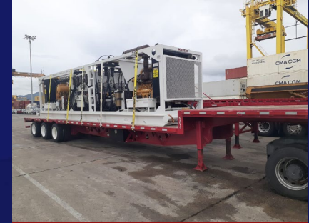
Vessel Agency, import, discharge, Customs clearance of HDD Drill Rig & Equipment & delivery to site