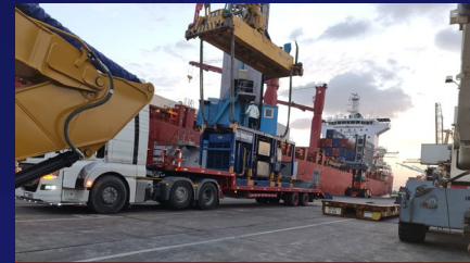
Loading & Securing of Cargo on Mafi for Export via Roll On/Roll Off Vessel