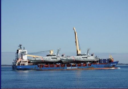
Vessel Agency, coordinate import and discharge of High-Speed Interceptor Boats and delivery to site