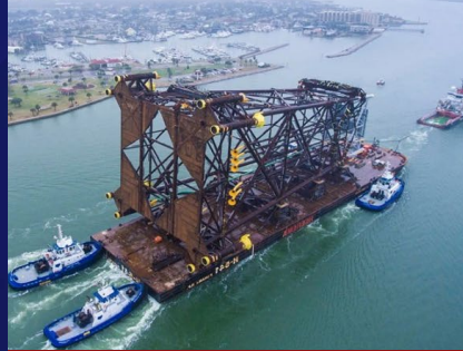
Vessel Agency & Clearance for Oil Rig Jacket