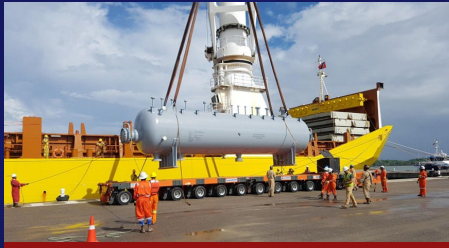
Discharge & Customs Clearance of Oil & Gas Cargo